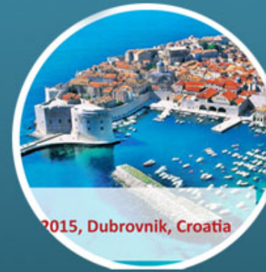
2015, Dubrovnik, Croatia

Dubrovnik is a historical city - a museum itself Since 1979, it is on the UNESCO list of World Heritage Sites